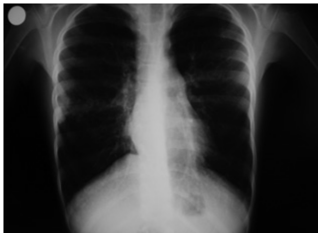
Figure 1. Interstitial appearance on lung graphy

rypsin: 174 mg/dL (normal), HIV (human immunodeficiency virus) serology (antiHIV): negative. With these results a diagnosis of primary FB was made and it was planned to start methylprednisolone with a dose of 1.5 mg/kg/day for 15 days and subsequently 1 mg/kg/day for 15 days with gradual tapering of the dose. In the follow-up, the symptoms and clinical findings of the patient regressed. Respiratory function tests performed after the 6th month of steroid treatment were as follows: FVC 80%, FEV 1 64% and PEF 97%. Simultaneous thoracic HRCT revealed that bilateral peribronchial thickenings, atelectasic areas and bronchiectasic changes continued. The patient is currently being followed up with inhaled steroid treatment. Her clinical findings continue in the 5 th year of the follow-up,