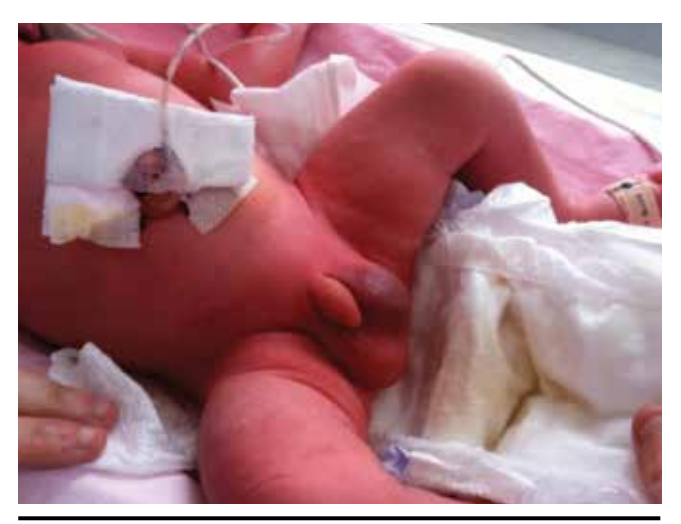
Figure 1. Discolouration of skin on the left scrotum

the left testicle had a size of 16x11 mm. The parenchymal echo of the right testicle was normal. The parenchymal echo of the left testicle was decreased and heterogeneous and an anechoic cystic space was observed in the middle (Figure 2). There was no blood supply in the left testicle. Left intravaginal testicular torsion with necrosis was considered observing that the left spermatic cord was directed from the left testicular hilus towards the parenchyma and its diameter was increased. The patient was operated on the 6th hour of life and it was found that the left spermatic cord was rotated 360° around its own axis intravaginally. It was observed that the blood supply did not improve, when the torsion was corrected. Hematoma and necrotic tissue were removed from the testicular capsule and orchiectomy was performed. Pathological examination revealed testicular tissue with hemorrhagic necrosis. No complication occured after operation and the patient was discharged at the age of 15 days.